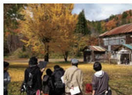
Shooting of "Hameln"